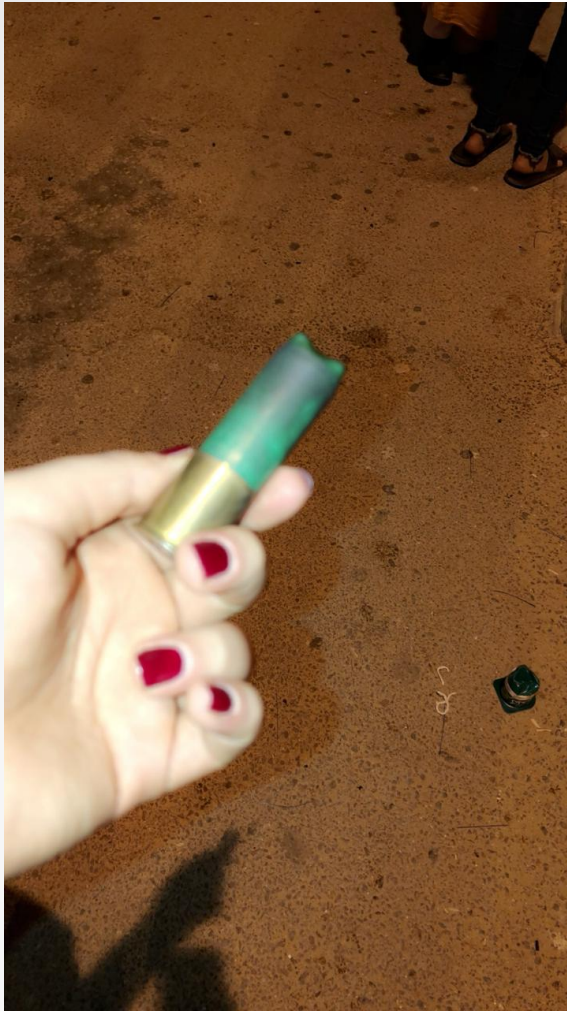
Figure 1 : Rubber-Bullets used by Moroccan Police

Two similar encounters recorded where the auxiliary vehicles ran over demonstrators. This time resulted in serious injuries .e.g. the young Sahrawi named Adnan was hit on the head and was transported the next day urgently to Marrakech for further treatment.